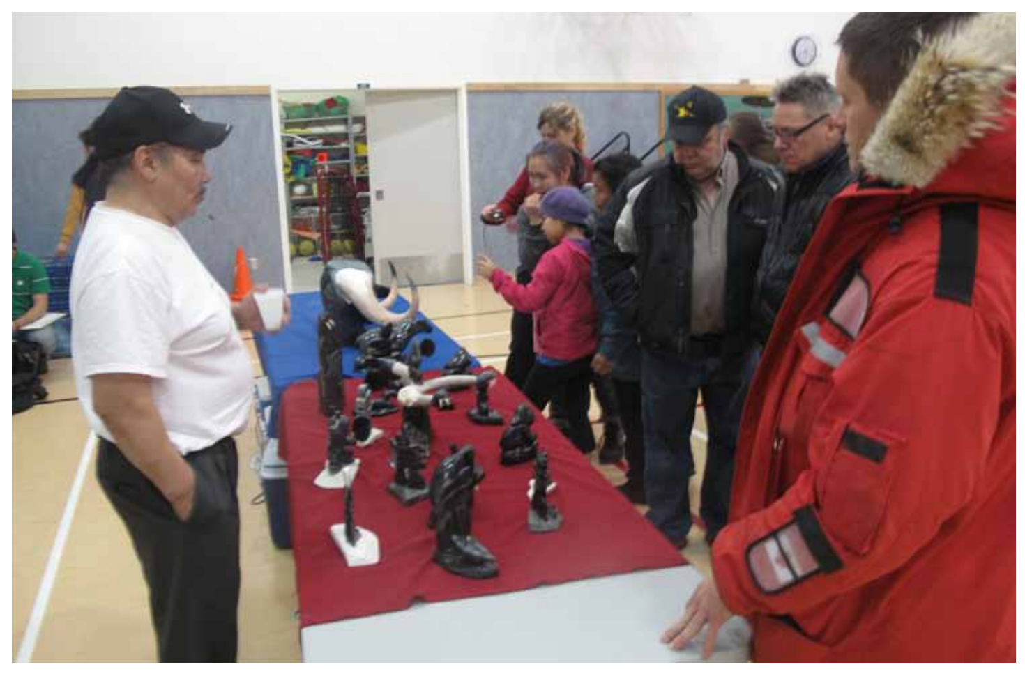
Carvings at the exhibit